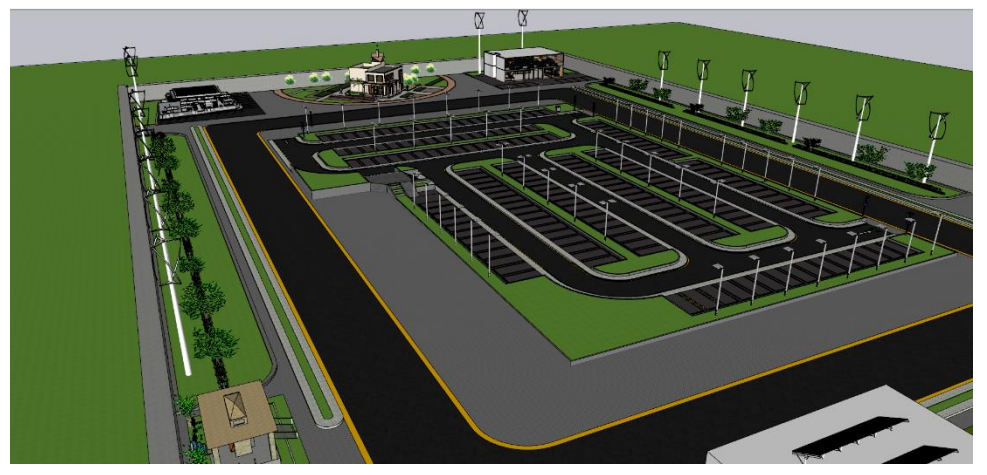
Fig.3 Detailed Overview Of Wind Turbine Placement