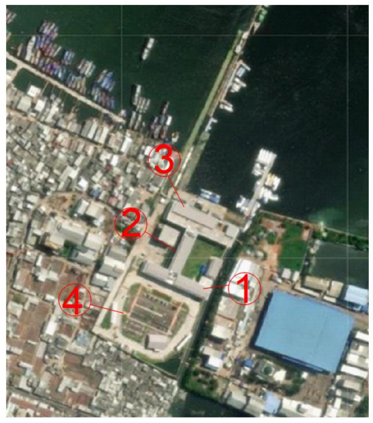
Fig.1 Top View of Port Plan