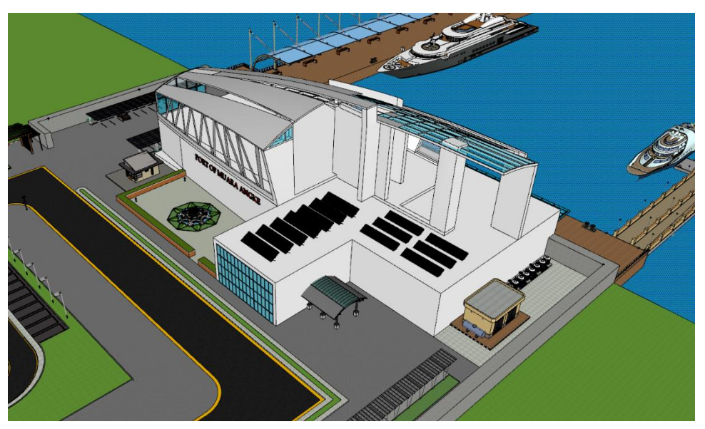
Fig.4 Detailed View Of Solar Panel Placement