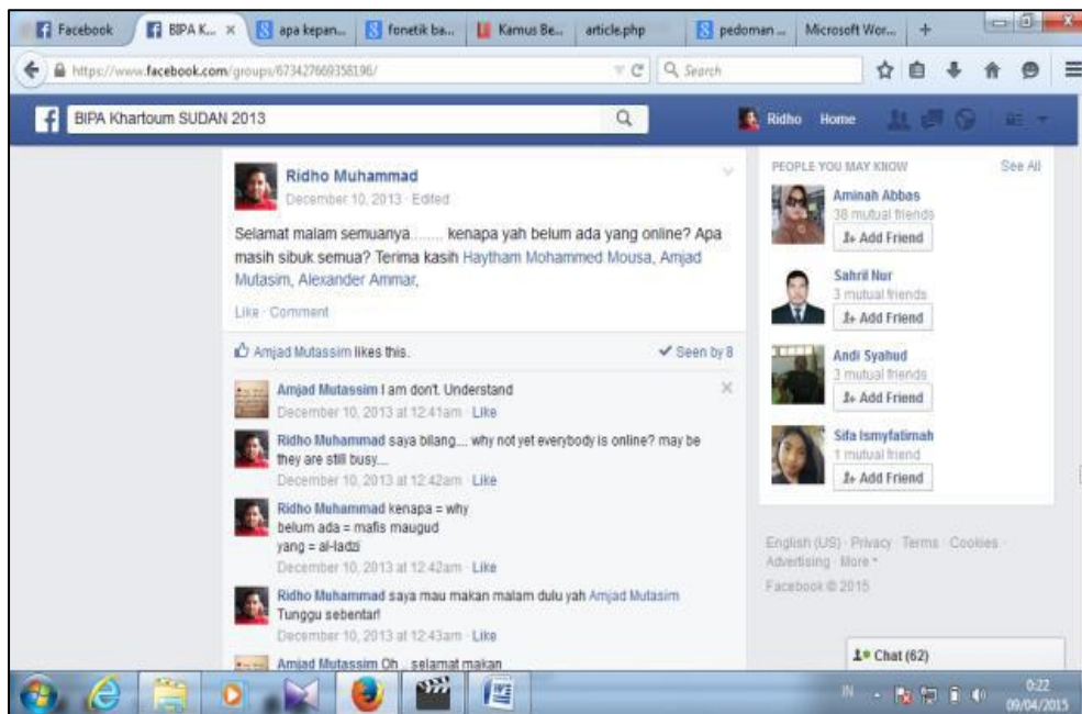
Figure 2. Example of participant chatting on FB

The following Fig. 2 is an example of chatting in Indonesian language by several BIPA participants: