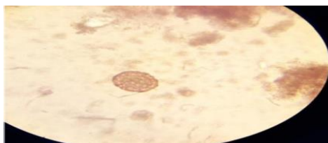
Figure 1. Ascaris sp. eggs

Samples of cow feces are taken directly from cattle herded by breeders in Bolo Sub-district, Bima District. The types of cattle raised by the local community are Bali cattle. The study focused on the incidence of intestinal worms in Bali cattle aged 5 to 12 months. The sample used was 50 samples. Based on the identification of 50 stool groups, samples found one egg class, namely Nematodes. Examination using the sedimentation and flotation method identified two types of worms: Ascaris spp. and Trichuris sp. Figure 1 and Figure 2.