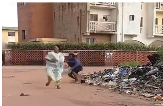
Figure 7. A scene from a Nollywood film, Christ in Me . The film shows a site of a hip of refuse dump located near a residential area in an urban city in Nigeria

Reflecting the themes of the films Wall-E , A Plastic Ocean , The Clean Bin Project , and Trashed , is capable of influencing and shaping Nollywood filmmakers' opinions towards creating the severity of solid waste and the importance of proper management in Nollywood. There are several documentaries and news bulletins on Nigerian television stations on waste management and environmental degradation and the need for a clean environment. While these clips educate the television audience on proper waste management, little or no full-length feature film tackles the problem of municipals and its effect on the citizens. There are however hundreds of scenes in Nollywood films where hips of refuse are shown near residential areas without references to its effect on occupants of the earth