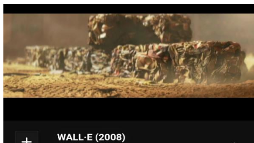
Figure 1. Hips of solid waste on the earth caused by thoughtless consumerism by earth inhabitants

Some films and documentaries exist whose themes are on waste management and the effect on biotic and a-biotic creatures. Some of these films include Trashed , Wall-E (animation film), The Clean Bin Project , and A Plastic Ocean . The animated film, Wall-E , deals with the bad condition of the earth's environment. The central theme is the consequence of years of environmental degradation and thoughtless consumerism by the earth's inhabitants. It features a robotic animated character whose work is to clean the earth of garbage and waste. Because of bad waste management, the earth is no longer inhabitable. Humans then abandoned the earth for hundreds of years because the Earth is overrun with garbage and devoid of plant and animal life. Humans then relocated to space for several hundreds of years while Wall-e works tirelessly to clean up the earth for it to be inhabited again.