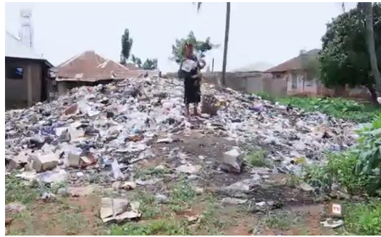
Figure 8. A scene from the Nollywood film, Moment of Madness . This scene shows a hip of solid waste near a rural-urban residential area in Nigeria. A madwoman is seen scavenging in the refuse

These portrayals no doubt have become the identity of the Nigerian community to the rest of the world where Nigerian films are patronized. The popular view of the Nollywood audiences after watching several films showing the hips of waste near residential areas in popular cities is that waste is thrown at will without considering the impact on the environment and the people that live in it. There is no country, especially the developing ones that do not have the issue of solid waste disposal and management. While it is almost impossible to shift camera lenses from materials like solid wastes, there is a need for Nollywood filmmakers to focus portrayal on effect and management rather than the passive portrayal of the subject. The unavailability of films that treat the issue of solid waste and management in Nigeria has almost handicapped environmental film critics who wish to probe further into the subject of municipals, film, and the environmental humanities.