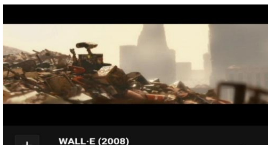
Figure 2. he animated cartoon character Wall-E cleaning up the garbage that humans have abandoned on the earth