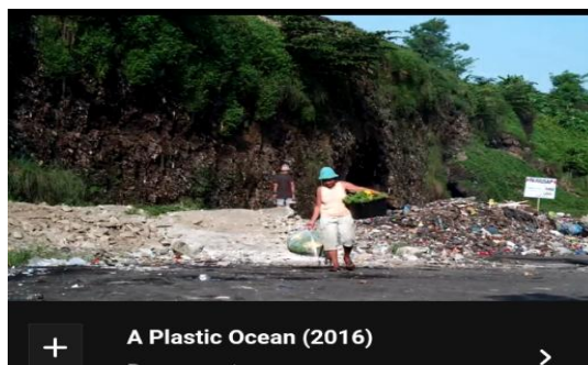
Figure 3. A clip from the film A Plastic Ocean. It shows refuse, especially plastics, thrown by the side of a river causing harm to sea creatures and humans

A Plastic Ocean is another documentary film that talks about the impact that plastic is having on our oceans and the marine animals that live there. Craig Leeson a journalist, Tanya Steeter, a diver, and a team of scientists investigate how human addiction to plastic is impacting the food chain and how that is affecting every one of us through new and developing human health problems. For four years, they explore the fragile state of our oceans, uncover alarming truths about plastic pollution, and reveal working solutions that can be put into immediate effect.