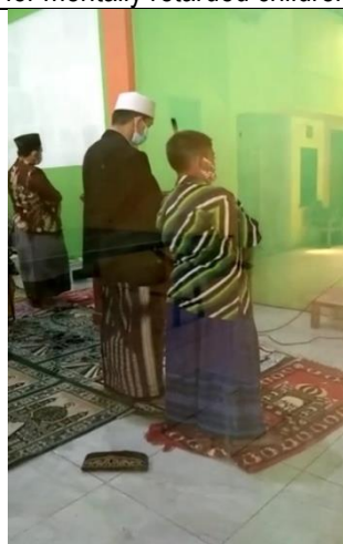
Figure 4. Parents give examples of praying in congregation at the mosque for mentally retarded children