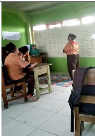
Figure 3. Parents motivate mentally retarded children in praying in front of teachers during PTM

Parents from a Javanese cultural background will give the spirit of teaching, not easily give up when doing various things, especially for their children in the hope that the child will progress in their development. The form of giving motivation from parents with Javanese background can be verbal and behavioral. Motivation in verbal form, for example, reminding mentally retarded children at all times so as not to neglect their duties and be disciplined in participating in learning. While motivation in the form of behavior is expressed by giving gifts to children if they have succeeded in doing their jobs well (Wahib, 2021). Below is a documentation of parents in motivating mentally retarded children when practicing movements and reading prayers in front of the teacher.