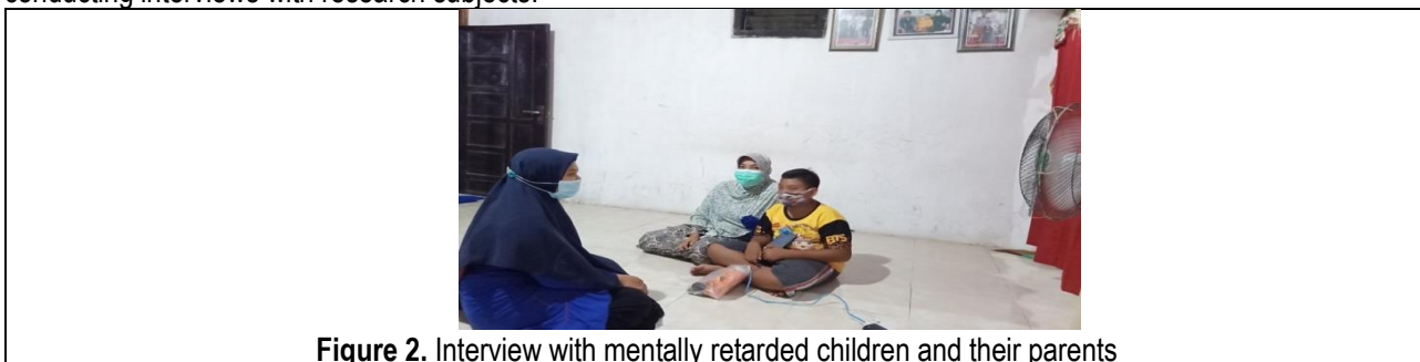
Figure 2. Interview with mentally retarded children and their parents

Based on study findings, it was concluded that the concern and participation of parents from Javanese cultural backgrounds in mentoring the learning of mentally retarded children during the Covid-19 pandemic had several roles, namely as motivators, educators, facilitators, directors, and supervisors. The following is the documentation when conducting interviews with research subjects.