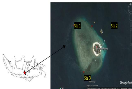
Figure 1. Location at Samalona waters, red spot indicating the sampling sites. sta 1 ( 5^{\circ}7.390^{\circ}\text{S} ; 119^{\circ}20.576^{\circ}\text{E} ), sta 2 ( 5^{\circ}7.513^{\circ}\text{S} ; 119^{\circ}20.330^{\circ}\text{E} ) and sta 3 ( 5^{\circ}7.699^{\circ}\text{S} ; 119^{\circ}20.506^{\circ}\text{E} ).

Sampling of tunicates was done at three different sites (sta.) of Samalona waters, Sangkarang Archipelago South Sulawesi Indonesia (Figure 1). SCUBA was used in collecting sample and LIT