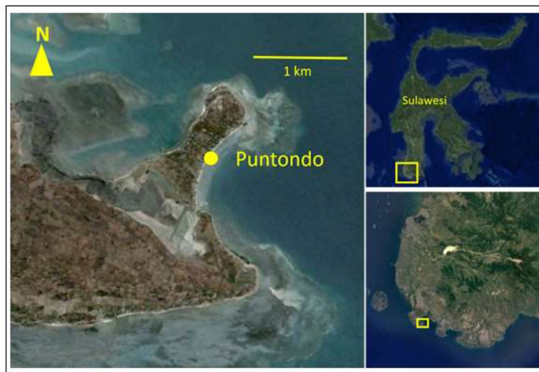
Figure 1. Map of the Study Sites

Seagrass Halophila spinulosa samples were collected from the subtidal zone in Puntondo Waters, Takalar Regency, South Sulawesi Province (5°35'32.29" South Latitude and 119°29'3.43" East Longitude) (Figure 1). The sampling location for H. spinulosa seagrass has several characteristics (Table 1).