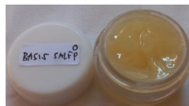
Figure 1. Ointment base

The ointment base is prepared by mixing anhydrous lanoline with vaseline to produce a yellowish semi-solid ointment base as shown in Figure 1.