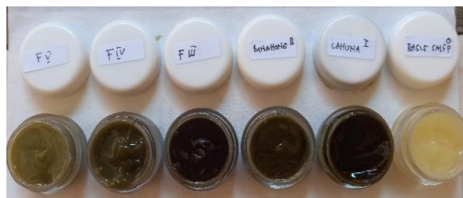
Figure 2. Formula ointment

The ointment is formulated into 5 formulations with varying concentrations of lahuna and binahong extracts. Formula I added 100% lahuna extract in an ointment base, formula II added 100% binahong extract, formula III added lahuna extract and binahong extract with a ratio of 75%: 25%, Formula IV with a ratio of 50%: 50% and Formula V 25%: 75%. Variations in ointment preparation formulas can be seen in Figure 2.