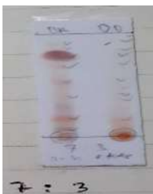
Figure 2. TLC result for eluent KVC

the tendency of molecules to attach to the surface (adsorption, absorption) (Hendayana., 2006). In this study used a stationary phase in the form of silica plate with a size of 5x10 cm with a distance of 3.5 cm and a mobile phase variation in the form of n-hexane: ethyl acetate with a ratio of 10: 0, 9: 1, 8: 2, 7: 3, 6: 4, 5: 5, 4: 6, 3: 7, 2: 8, 1: 9, 0:10 and ethyl acetate: methanol with a ratio of 9: 1, 8: 2, 7: 3, 6: 4, 5: 5, 4: 6, 3: 7, 2: 8, 1: 9, 0:10. From the results of the TLC, the best separation was obtained from the variation of the mobile phase (eluent) n-hexane: ethyl acetate with a ratio of 7: 3, based on the results of this TLC that would be a reference in the separation of compounds using column chromatography.