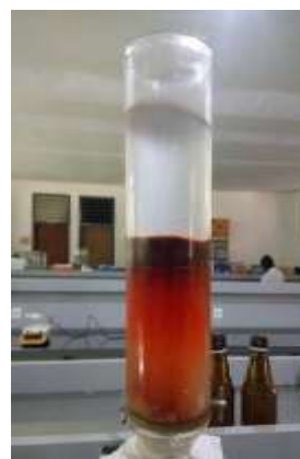
Figure 3. Chromatography Vacuum liquid

Liquid vacuum chromatography in this study began in the best solvent from KLT, namely n-hexane: ethyl acetate with a ratio of 7: 3, the solvent used was a 100 ml per for each increase in the gradient of polarity. In this study the n-hexane: ethyl acetate (7: 3) solvent was accommodated in the first 17 vials, because there was no band that went down then n-hexane: ethyl acetate 6: 4, 5: 5, 4: 6, 3: 7, 2: 8, 1: 9, and 0:10 to continue on ethyl: methanol 9: 1, 8: 2, 7: 3, 6: 4, 5: 5, 4: 6, 3: 7, 2: 8, 1: 9 and 0:10.