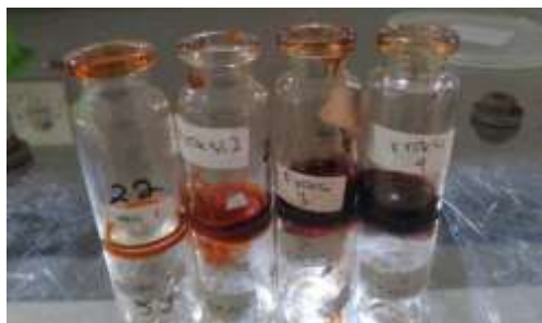
Figure 4. Mix Fraction

The combined fraction obtained was done by phytochemical screening to see which chemical compounds were contained in each of these vials. The results of the combined fraction phytochemical screening are as follows Table 3.