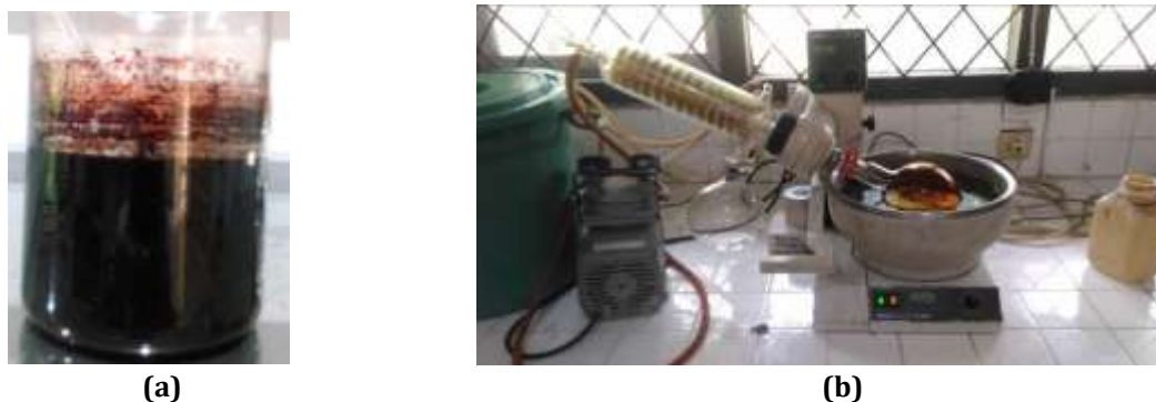
Figure 1. (a) Results maceration of Dragon's blood; (b) Concentration of Extract with Vacuum Rotary Evaporator

clear cell wall to dissolve the active substance so that there are differences in a concentration inside and outside the cell causing diffusion of active substances in cells towards the outside of cells (Atun 2014).