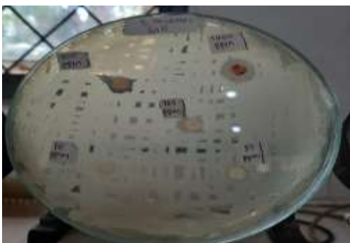
Figure 6. Antibacterial testing against Streptococcus mutants

From Table 5 above it can be seen that the ethanol extract of dragon's blood Daemonorops didymophylla has the potential as an antibacterial against Streptococcus mutants where the higher the concentration of the extract the higher the inhibition zone produced. In fraction 1 it is known to have the highest activity compared to other fractions as against antibacterial the bacterium Streptococcus mutants . Research on dragon's blood against bacteria Streptococcus mutants has never been done before. dragon's blood belongs to the family Arecaceae, one family with areca nut (Areca catechu), antibacterial testing of Streptococcus mutants areca nut ethanol extract has been done previously Ningsih (2018) with areca nut ethanol extract concentrations of 2.5%, 3% and 3.5% has antibacterial activity of Streptococcus mutants with an average inhibition zone of 14.96 mm, 15.49 mm and 17.05 mm.