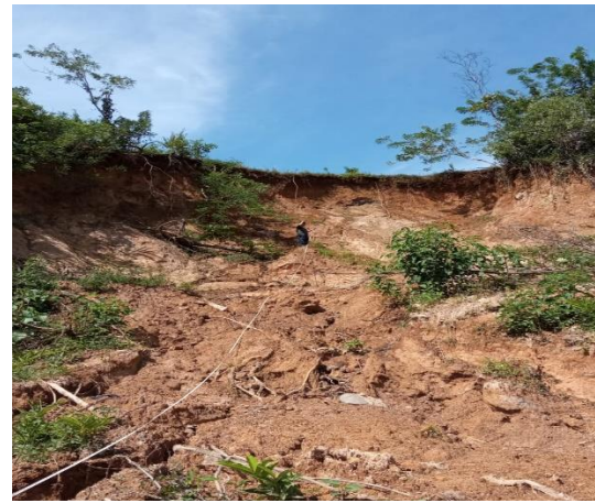
Figure 1. Documentation of the location of the North Bengkulu - Lebong crossing road that experienced a landslide on 26 March 2022.

processing results: dominant frequency ( f_0 ) and amplification ( A_0 ). In addition, microtremor data can be used to find seismic susceptibility index, sediment layer thickness, Peak Ground Acceleration (PGA), and Ground Shear Strain (GSS), which are used as parameters for analysis in identifying potential landslide areas (Refrizon et al., 2013). The landslide-prone zonation areas can be mapped based on the PGA and GSS values obtained from the HVSr method.