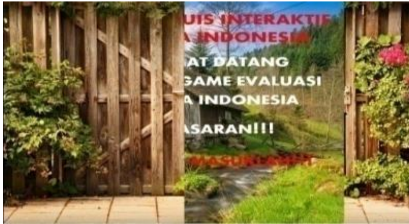
Figure 3. Display Page Introduction

The introductory page display will open automatically after the gate is pressed. This display also includes audio that contains the command sentence! The following is the introductory page display image.