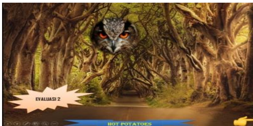
Figure 6. Display of the First Trial Tutorial