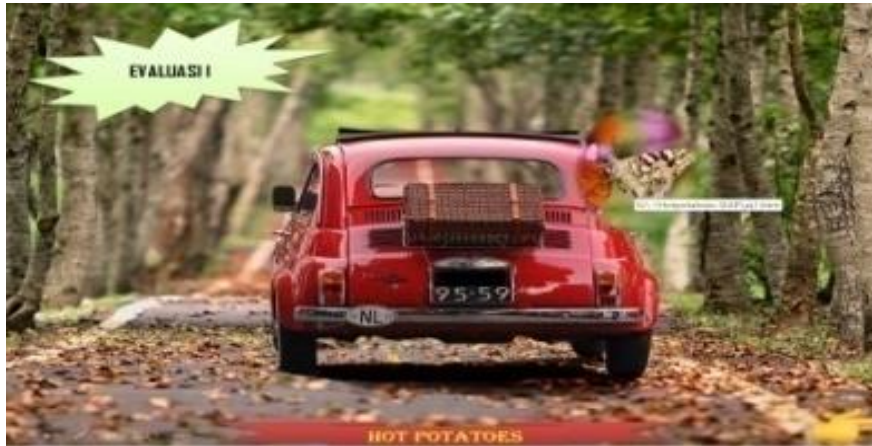
Figure 5. Trial Tutorial Page Views