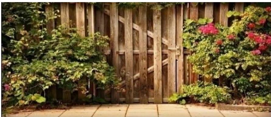
Figure 2. Opening Page Views

The opening page display is displayed first when the learning media application starts. It looks, that is, a closed wooden fence. To open it, click the "Open" button. The following is the appearance of the opening page.