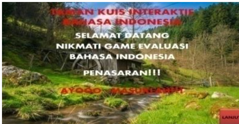
Figure 4. Display Page Introduction

The introductory page contains persuasive statements. It is intended that students can be motivated and challenged to demonstrate their ability to work on the Indonesian language problems presented. The following is an introductory page view.