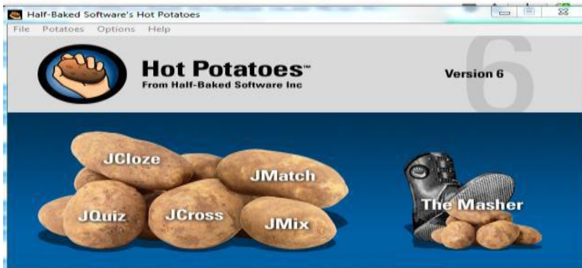
Figure 1. Home Hot Potatoes

The five programs contained in this software, are: (1) JQuiz; (2) Jmix; (3) Jcross; (4) Jmatch; (5) Jcloze (p. 69)