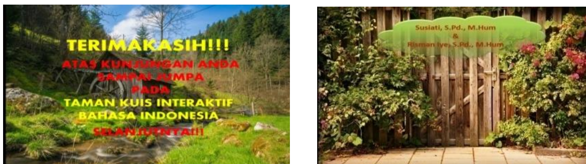
Figure 9. Cover Page Display