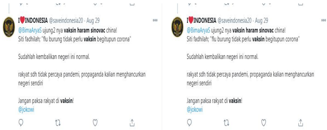
Figure 1. @saveindonesia20

According to Tempo data, on March 3, 2021, the Ministry of Communication and Informatics captured 667 URLs suspected of spreading hoaxes (Francisca, 2020). Hoax messages related to Covid-19 do not convince people that the virus exists, especially the vaccine. There is also the possibility that hoax discourses could interfere with reasonable thought (Brughemann et al., 2020). Using social media, the bogus information can be widely disseminated (Assiroj et al., 2018). Due to the numerous hoaxes that are being circulated on social media, particularly Twitter, people are concerned about getting vaccines.