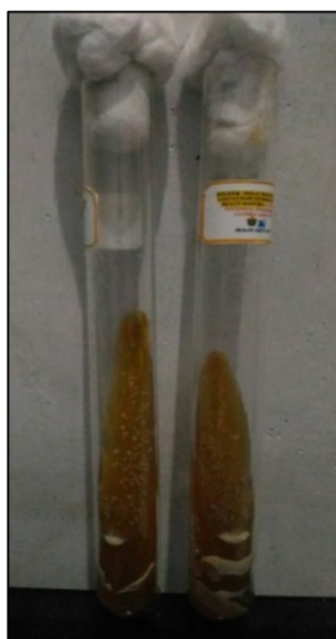
Figure 2. The collection of potent lactic acid bacteria isolates as anti candidiasis

From the table above, it can be seen that the average inhibitory zone diameter of the oral mucosa of infants (MB and MB2) is 7.23 mm and 7.20 mm (average 7.22 mm ± 0.02 mm), lactic acid bacteria isolate from the oral mucosa of children (MA) is 9.30 mm and 10.13 mm (average 9.72 mm ± 0.58 mm), and lactic acid bacteria isolate from adult mouth mucosa (MD) were 16.17 mm and 16.03 mm (average 16.10 mm ± 0.09 mm). While the results of inhibitory power using ketoconazole antifungal drugs as a comparison were 19.07 mm and 19.30 mm (average 19.19 mm ± 0.16 mm). It is showed that lactic acid bacteria isolates from adult mouth mucosa (MD) had the best inhibitory power seen from their larger inhibitory diameter zones compared to both infant isolate (MB) and child isolate (MA).